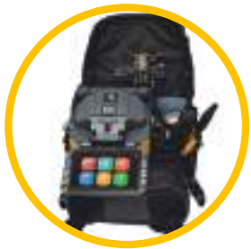
Work Table Bag