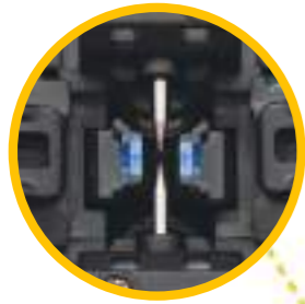
Applicable Cleaved Length - Up to 5mm