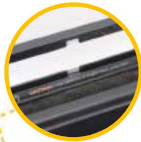
Heating Time - 18 sec <60mm sleeve>