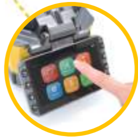
Full Touch Screen - GUI Interface - Tempered Glass