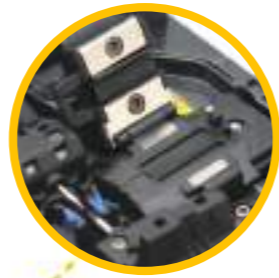
Universal Holder - 250 - 900 - 2-3 - Indoor