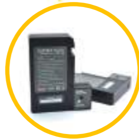
Two Batteries are Included in Standard Package - 600 cycles (splicing & heating) with Two Batteries